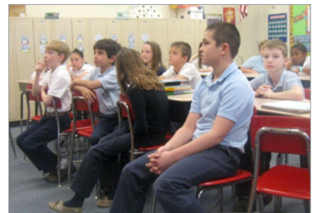
ABOVE: Students of St. Hilary Elementary School learn effective ways to deal with these bullying situations. One girl turns her view away from the drama.

For information on providing these interventions at your school, contact karenmckelvey@psi-solutions.org